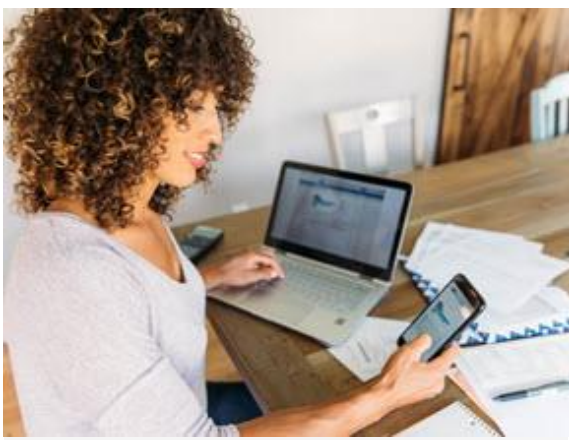
2020 Year-End Tax Planning for Your Business

This webinar will help you to get real with money, understand your costs, and manage your cash to create and maintain stability and profitability.