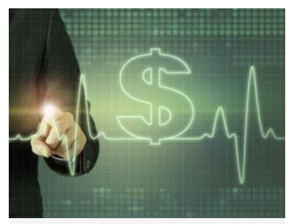
Understanding Cash Flow - A Critical Component to the Life of Your Business

This webinar will help you to get real with money, understand your costs, and manage your cash to create and maintain stability and profitability.