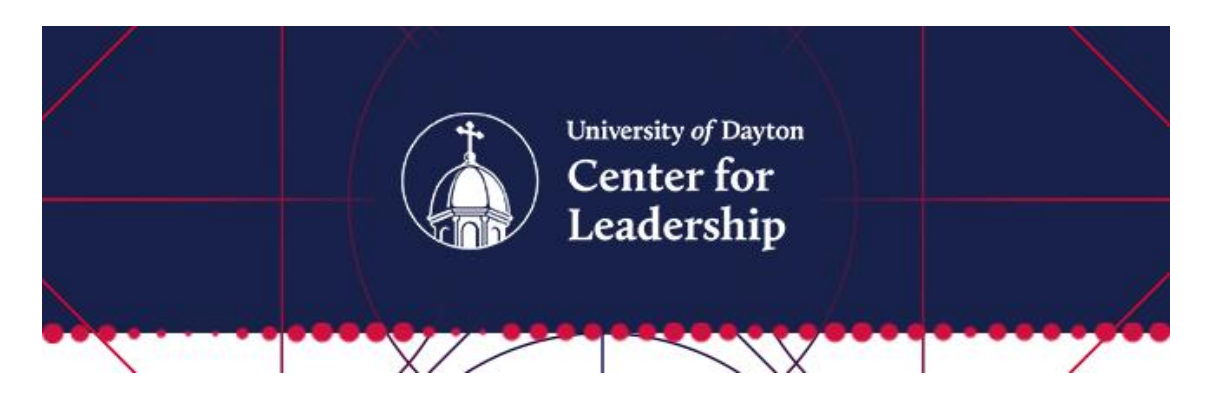
The Best Leaders Never Stop Learning