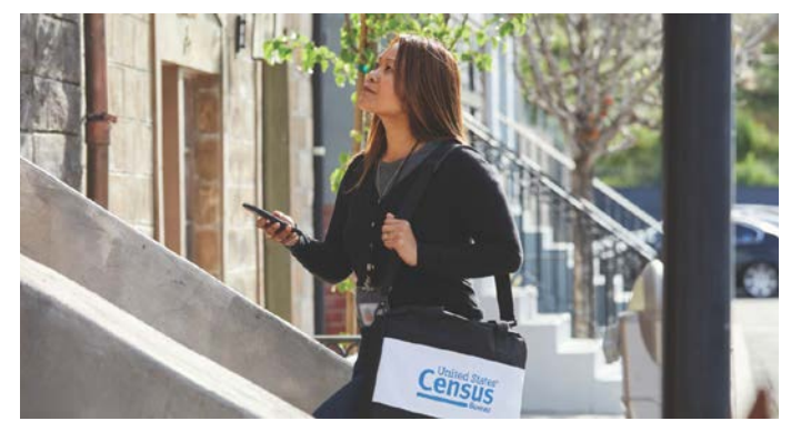
The U.S. Census Bureau is still hiring for a variety of temporary jobs throughout the state.