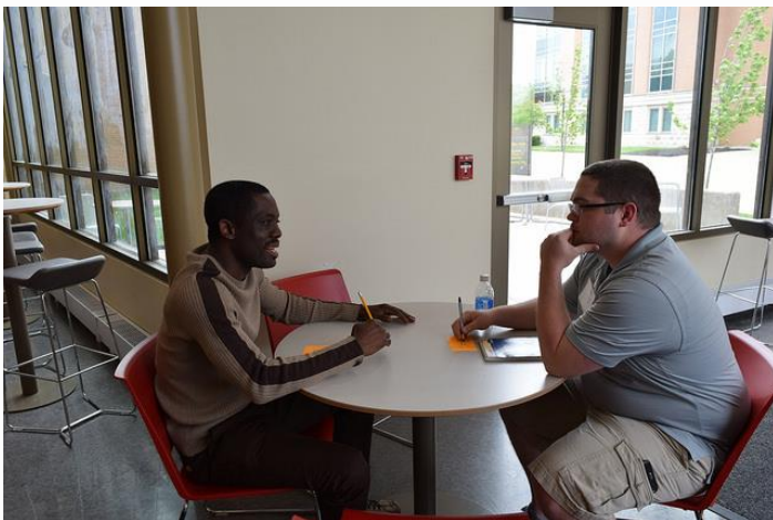
Pictured above: M.S. in Logistics and Supply Chain Management students working on a technique building exercise.