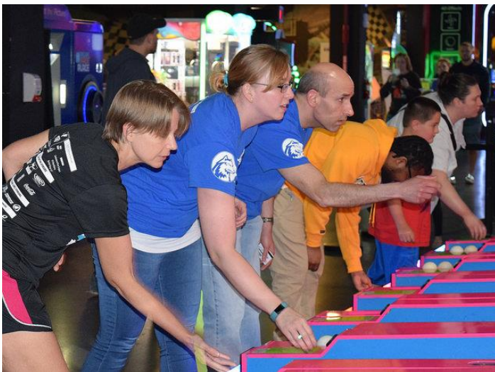
Pictured above: Master of Information Systems students get to experience Scene 75 hands-on after presentations.