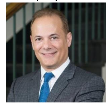
CEO Economic Development Alliance of Skagit County