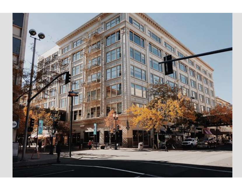
"Bridging" the Financial Gap With Regional Public-Private Partnerships