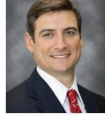
Miller-Valentine Group Realty Services