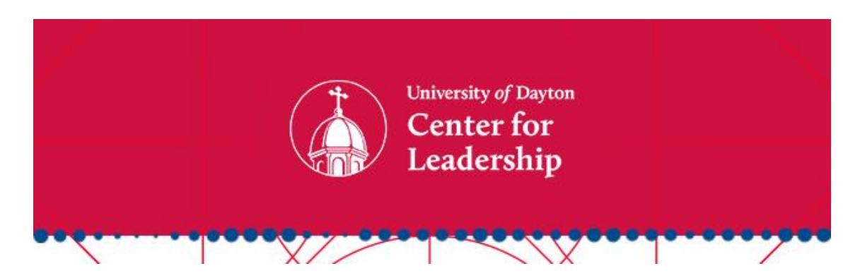
The Best Leaders Never Stop Learning