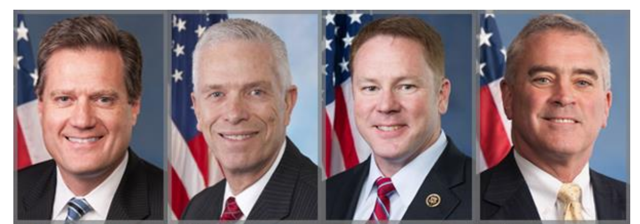
Congressman Michael Turner, Ohio 10th District The State of National Defense