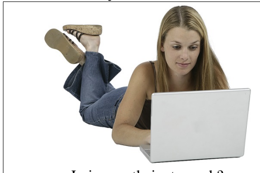
Lying on their stomach?