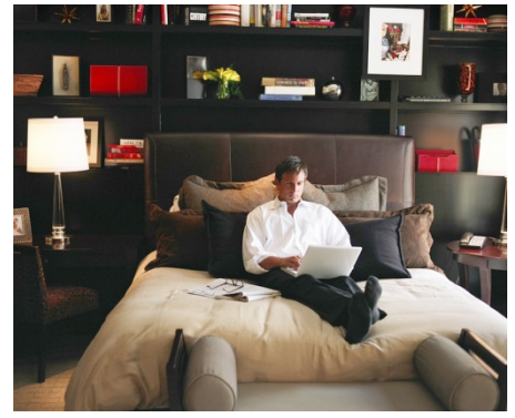
Or maybe the bed?