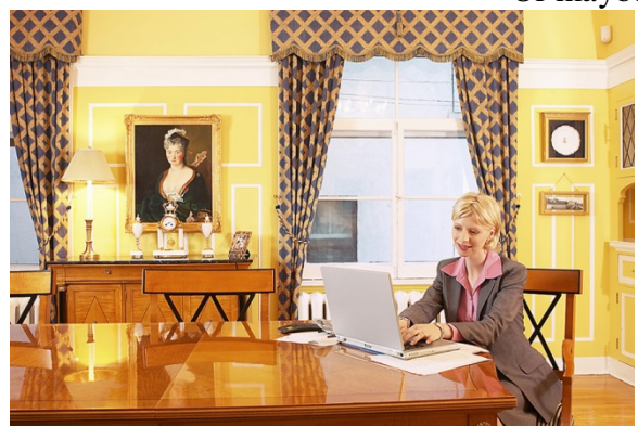
Or the dining table?